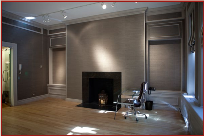
FIREPLACE, SOUTH GALLERY