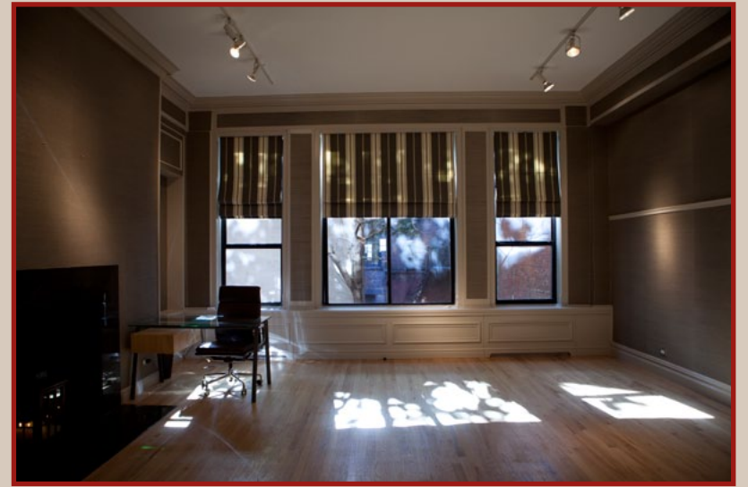
WINDOWS, SOUTH GALLERY